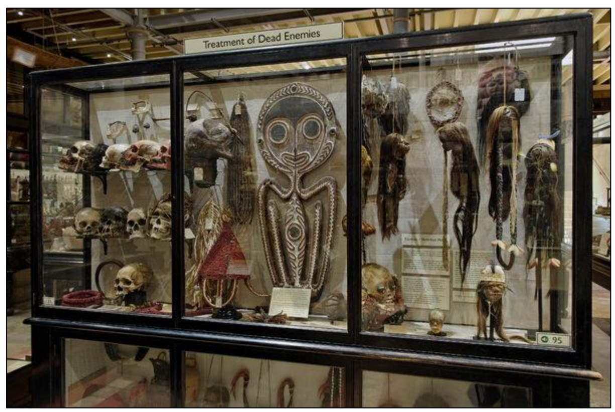
Human remains are among the items on display in a vitrine called "Treatment of Dead Enemies" at the Pitt Rivers Museum in Oxford, England.

In the restitution debate swirling through European museums, the treatment of human remains has been cited as an area of steady progress. Museums say that putting skeletons and relics on display aids understanding of world cultures and scientific development throughout history. But some were taken from indigenous groups.