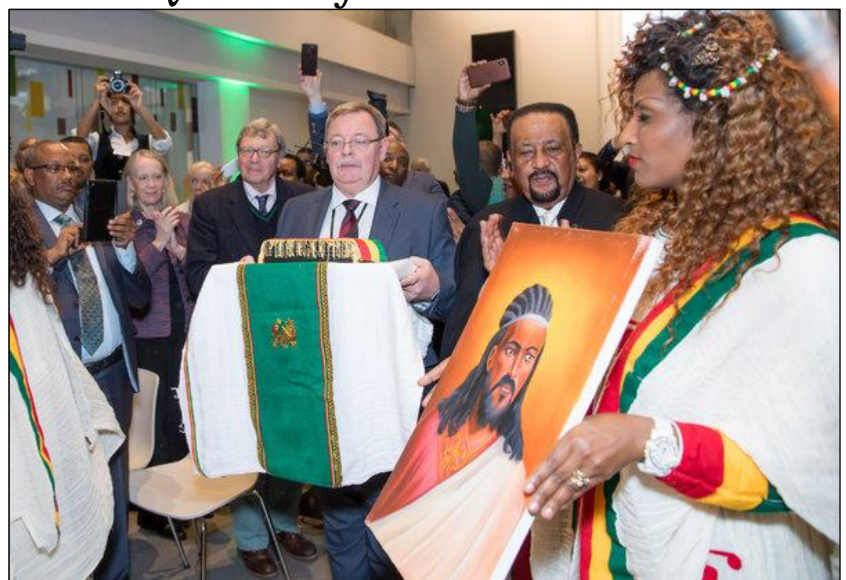
Britain's National Army Museum on Wednesday returned locks of hair belonging to Emperor Tewodros II of Ethiopia, who died in 1868, to Ethiopia's government.

Living Things, With No Bone or Tissue, Pose a Quandary for Museums